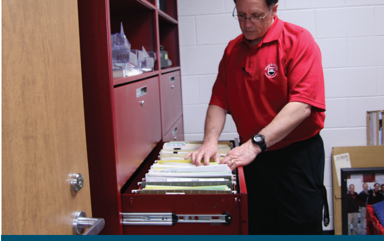
Office Administration Areas