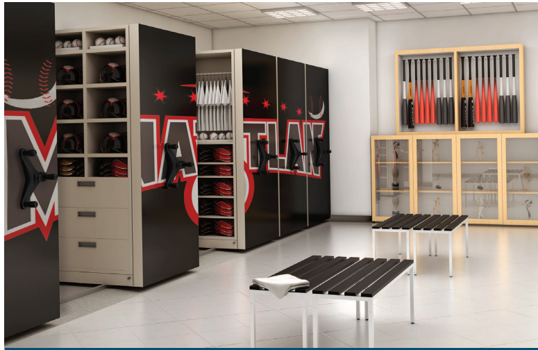
Athletic Equipment Room Storage