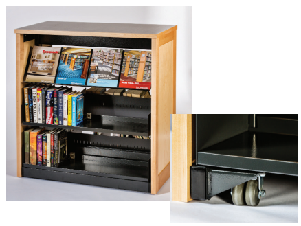
Concealed Caster Units