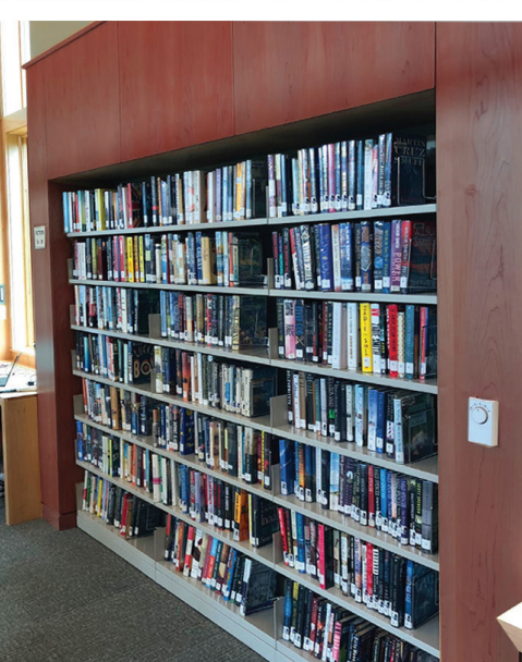
Top Shelf Solutions for Today's Libraries™