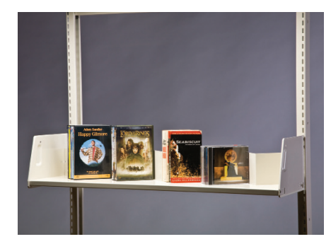
Zig Zag Display Shelf